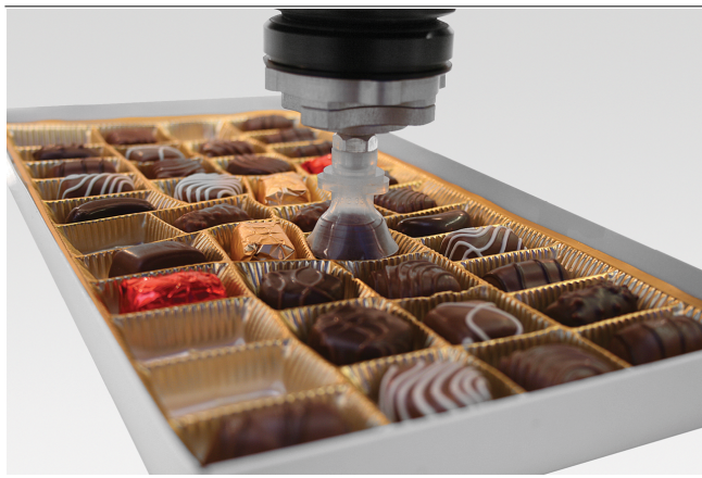
Chocolate suction cups SPG being used for handling chocolates