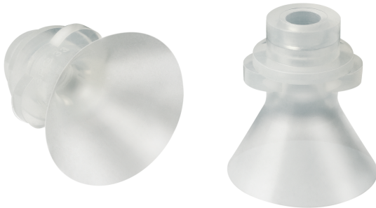
Chocolate Suction Cups SPG